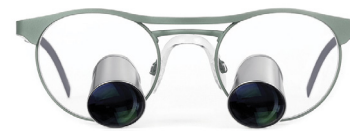
SPLASH frame colours