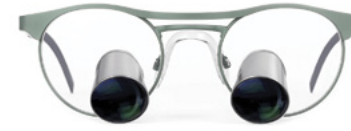
SPLASH frame colours

With ExamVision, you can expect an extensive range of colours and frames that not only provide support, comfort and functionality but also elevate your professional appearance.